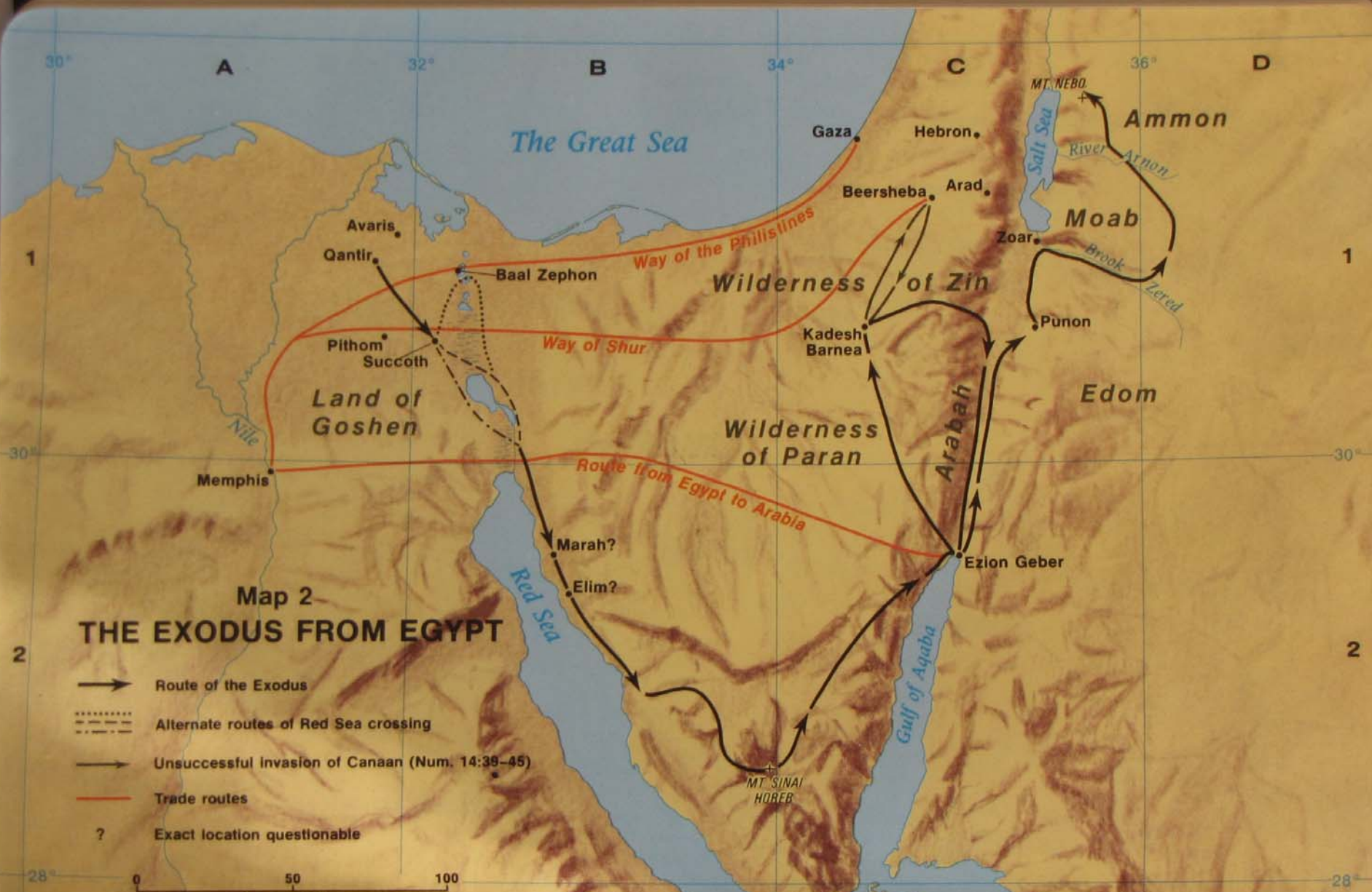
Thomas Nelson, Broadman & Holman, Zondervan, Cambridge; all portray and un-Biblical Exodus route – none cross the Red Sea...