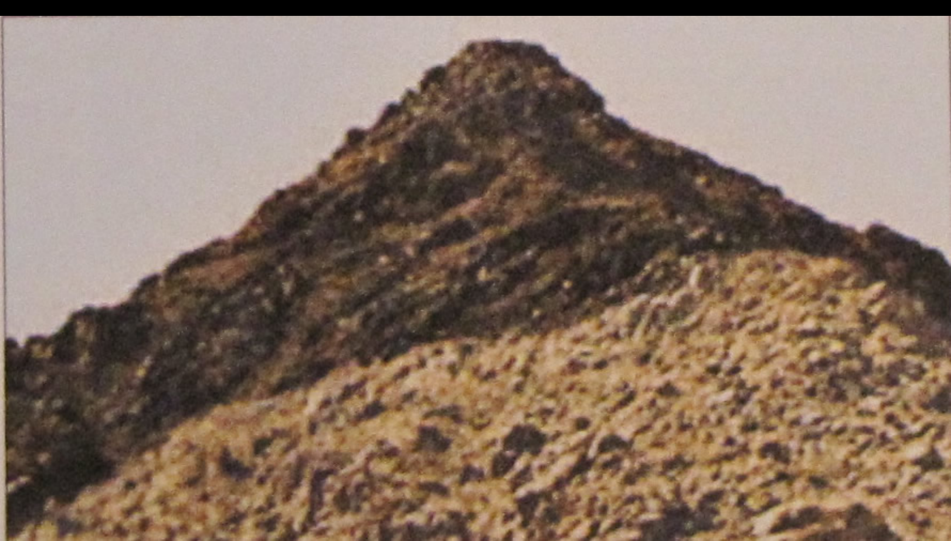
Jabal Al Lawz, closer up – scorched / burned summit