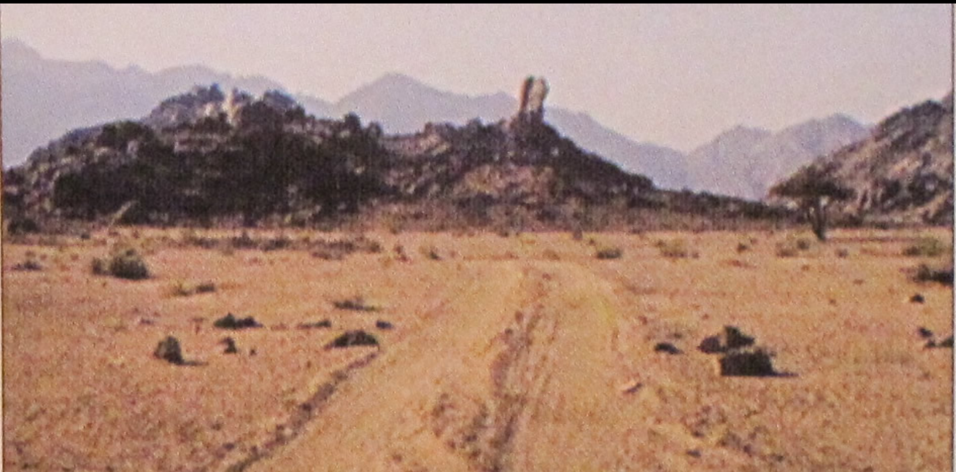
Split rock of Horeb in the distance