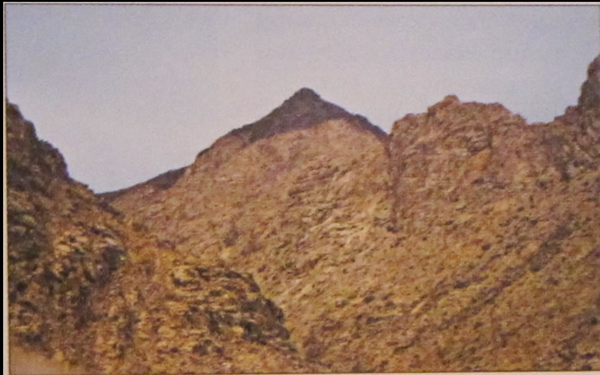
Jabal Al Lawz, highest mountain in the area – depicting burned / scorched summit