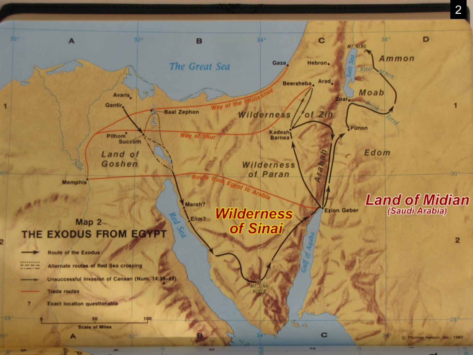
Map 2 THE EXODUS FROM EGYPT